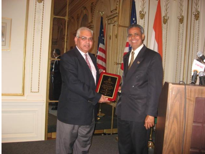
Recognition plaque by the Deputy Speaker Upendra Chivukula, of the New Jersey Assembly dated May 15, 2009