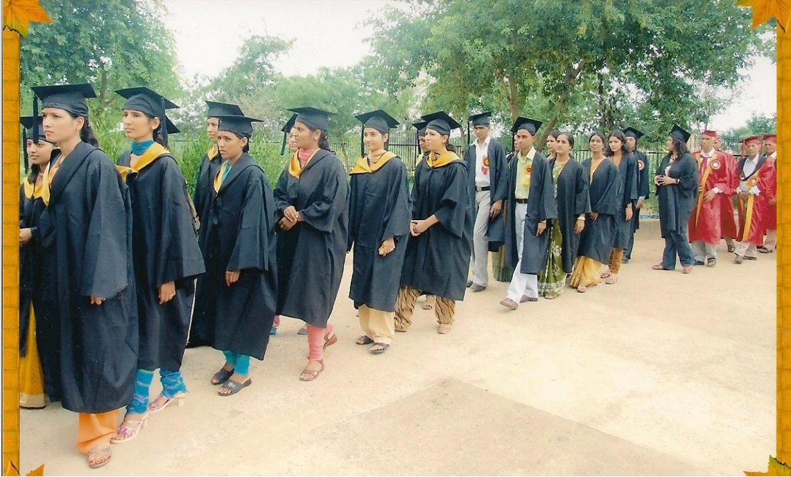
The Final march....